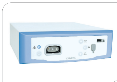
Front frame color