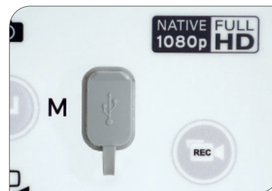
Full HD image / video capturing

Technical specifications are subject to change. The information is not legally binding. The contents are only for information about our products. Reprint, in whole or in part, is not permitted. Medical devices are only allowed to be marketed and used in countries where they have been approved for sales by regulatory authorities. For information on the available market access please contact us.