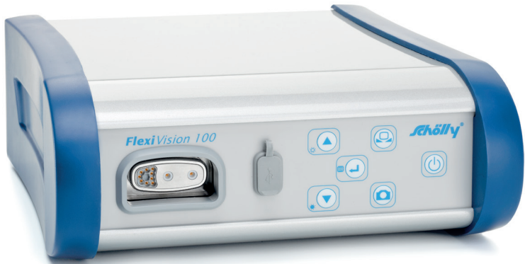
FlexiVision 100 - Full HD Inspection System

Which connecting device fits to your application