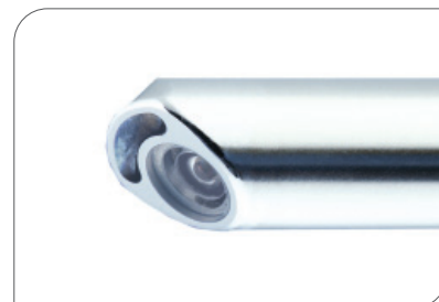
Direction of view: 45°

Technical specifications are subject to change. The information is not legally binding. The contents are only for information about our products. Reprint, in whole or in part, is not permitted. Medical devices are only allowed to be marketed and used in countries where they have been approved for sales by regulatory authorities. For information on the available market access please contact us.