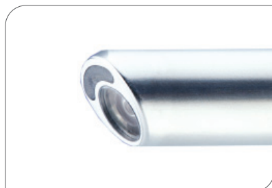
Direction of view: 30°