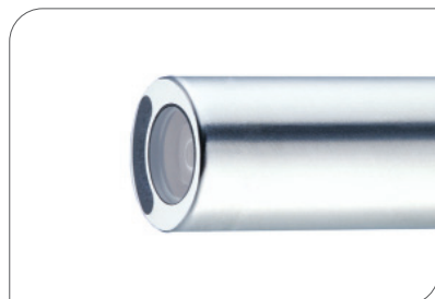
Direction of view: 0°