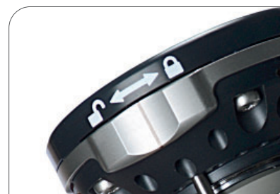
Lockable endoscope connection

Technical specifications are subject to change. The information is not legally binding. The contents are only for information about our products. Reprint, in whole or in part, is not permitted. Medical devices are only allowed to be marketed and used in countries where they have been approved for sales by regulatory authorities. For information on the available market access please contact us.