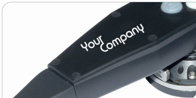
Logo / Labeling