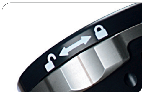
Lockable endoscope connection