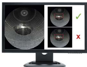
The inspection on the left, the reference image on the right

With the Split Screen function, a static image can be shown on the monitor next to the live image of the inspection. In addition, the image is stored on the USB stick of the FlexiVision 100. It is possible, for example, to store reference images of the component, which can be used as comparisons.