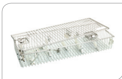
Cleaning and storage basket