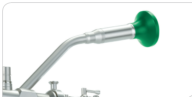
Color of eyepiece cap