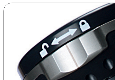
Lockable endoscope connection

Technical specifications are subject to change. The information is not legally binding. The contents are only for information about our products. Reprint, in whole or in part, is not permitted. Medical devices are only allowed to be marketed and used in countries where they have been approved for sales by regulatory authorities. For information on the available market access please contact us.