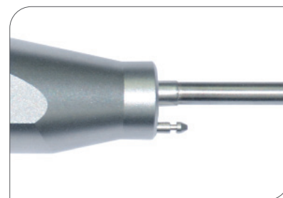
Connection system Olympus

Technical specifications are subject to change. The information is not legally binding. The contents are only for information about our products. Reprint, in whole or in part, is not permitted. Medical devices are only allowed to be marketed and used in countries where they have been approved for sales by regulatory authorities. For information on the available market access please contact us.