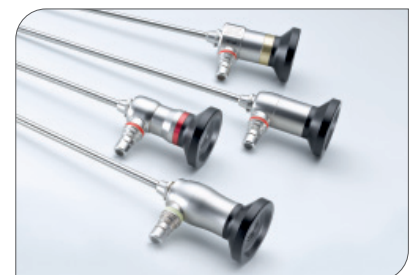
Shape of main body