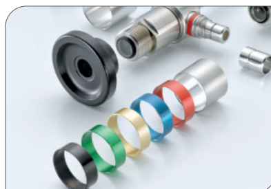
Color of serial ring