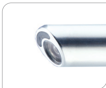
Direction of view: 30°