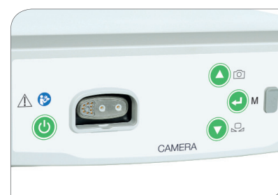
Private Label Design