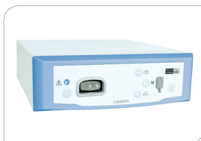
Front frame color