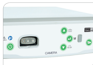
Private Label Design