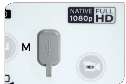
Full HD image / video capturing

Technical specifications are subject to change. The information is not legally binding. The contents are only for information about our products. Reprint, in whole or in part, is not permitted. Medical devices are only allowed to be marketed and used in countries where they have been approved for sales by regulatory authorities. For information on the available market access please contact us.