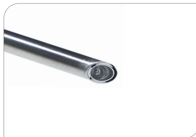
Direction of view: 45°