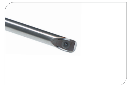
Direction of view: 70°

Technical specifications are subject to change. The information is not legally binding. The contents are only for information about our products. Reprint, in whole or in part, is not permitted. Medical devices are only allowed to be marketed and used in countries where they have been approved for sales by regulatory authorities. For information on the available market access please contact us.