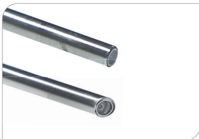
Direction of view: 0° - 30°