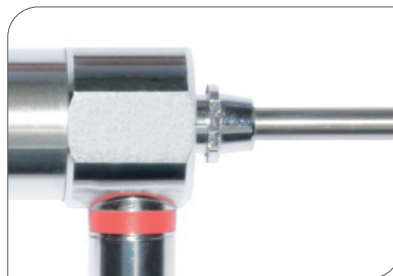
Connection system Wolf