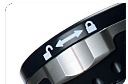
Lockable endoscope connection

Technical specifications are subject to change. The information is not legally binding. The contents are only for information about our products. Reprint, in whole or in part, is not permitted. Medical devices are only allowed to be marketed and used in countries where they have been approved for sales by regulatory authorities. For information on the available market access please contact us.