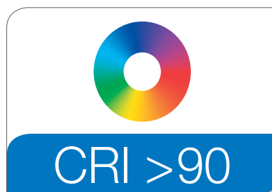
High CRI Ra > 90