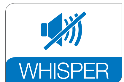
Very silent device

Technical specifications are subject to change. The information is not legally binding. The contents are only for information about our products. Reprint, in whole or in part, is not permitted. Medical devices are only allowed to be marketed and used in countries where they have been approved for sales by regulatory authorities. For information on the available market access please contact us.