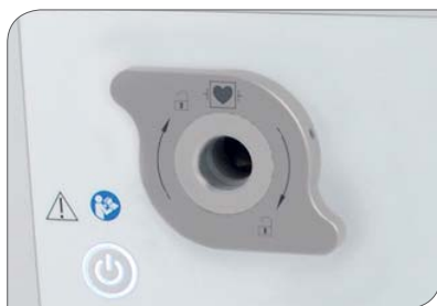
Multi light guide adapter