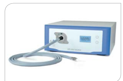
Front frame color