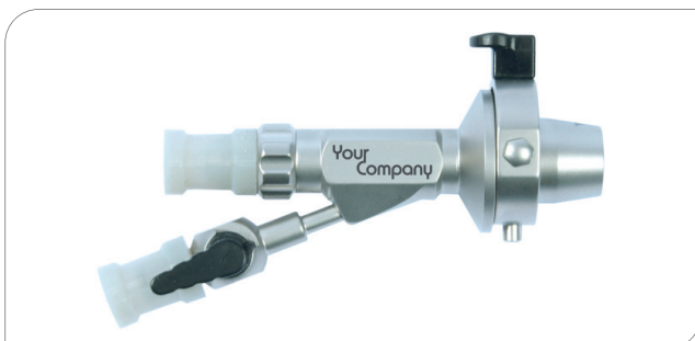
Logo / Labeling