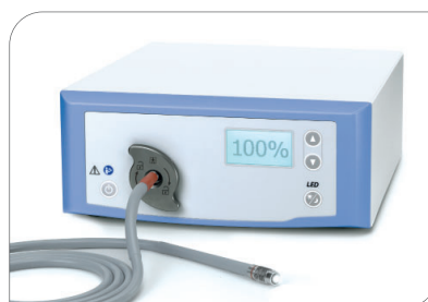
Front frame color