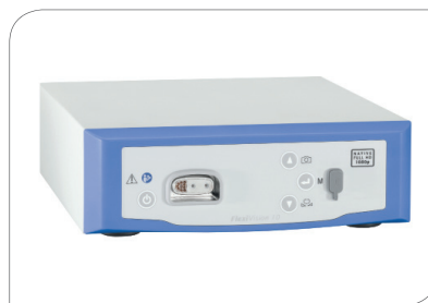
Front frame color