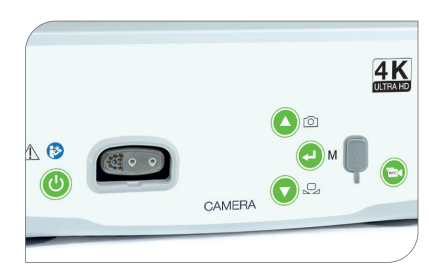
Button color and button illumination color