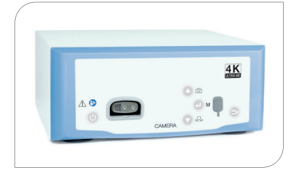
Front frame color