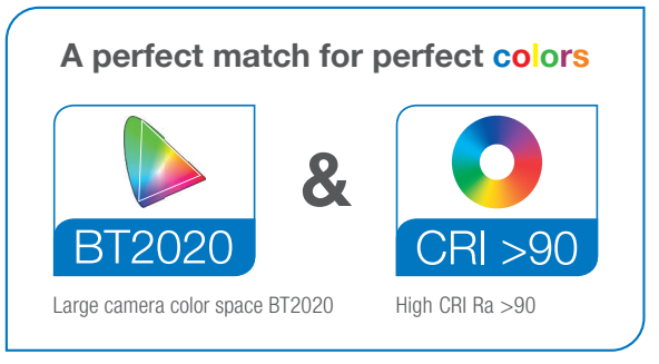
FlexiVision 40 camera with FlexiLux 300 LED light source

Technical specifications are subject to change. The information is not legally binding. The contents are only for information about our products. Reprint, in whole or in part, is not permitted. Medical devices are only allowed to be marketed and used in countries where they have been approved for sales by regulatory authorities. For information on the available market access please contact us.